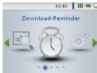
Reminder for due downloads

Order no. for DLKPro Download Key: A2C59514502 Order no. for DLKPro Licence Card: A2C59514674 Order no. for DLKPro Power Box: A2C59514675 Order no. for DLKPro Neoprene Case: A2C59514917