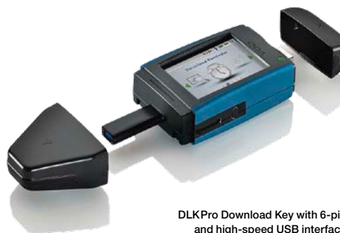
DLKPro Download Key with 6-pin and high-speed USB interface